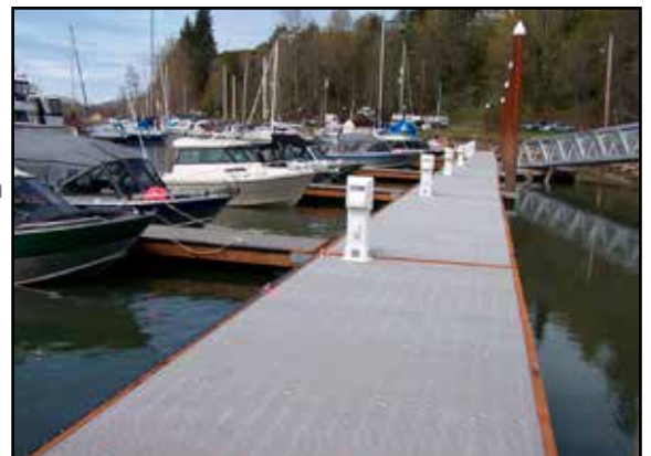
Application: Marina Decking Product: Safe-T-Span Pultruded Grating