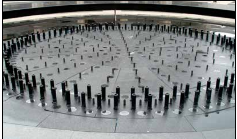
Product: Fibergrate® Covered Moulded Grating Application: Lincoln Center Fountain