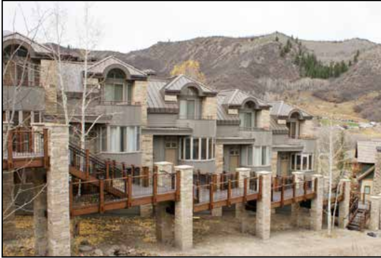
Application: Walkways and Stairs Product: Safe-T-Span® Pultruded Grating