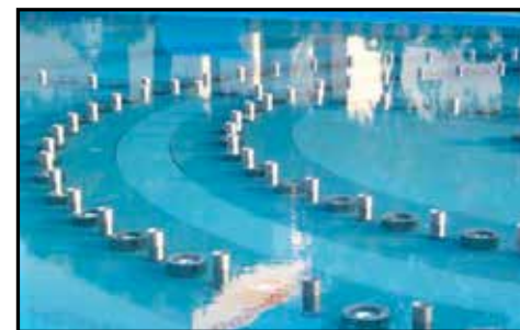
Application: Fair Park Fountain Product: Fibergrate Moulded Grating