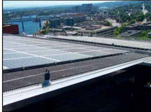
Application: Rooftop Solar Panel Walkway Product: Fibergrate® Moulded Grating