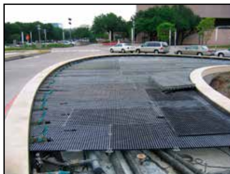
Application: Galleria Fountain Product: Fibergrate Moulded Grating